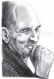
Ingmar Bergman Born 1918

Ingmar Bergman is a well known Swedish director of films noted for their starkness, their subtle use of black and white and 'shades' of those extremes, the ambiguity of their content, and a certain brooding presence that seems to pervade them all. The list of Bergman films is long; his best known include The Seventh Seal (1957), Wild Strawberries (1958), The Virgin Spring (1960), The Silence (1963), Persona (1967), The Passion of Anna (1970), and Cries and Whispers (1973)—this last film in colour, though emphasising red in all its shadings. In the following selection, the Introduction to Four Screen-plays by Ingmar Bergman (1960), Bergman discusses how he views the art of film-making.