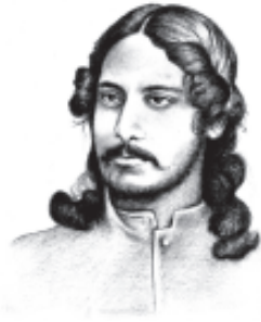
Rabindranath Tagore 1861-1941

Rabindranath Tagore was a poet, novelist, short-story writer and dramatist. He was awarded the Nobel Prize for Literature in 1931. Tagore's interest in drama was fostered while he was a boy, for his family enjoyed writing and staging plays. The music in his plays is instrumental in bringing out the delicate display of emotion around an idea. The central interest in his plays is the unfolding of character; of the opening up of the soul to enlightenment of some sort.