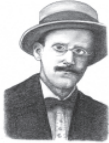
James Joyce 1882-1941

James Joyce is a major literary figure of the first quarter of the twentieth century. He is known for his bold experiments in narrative techniques in fiction, and Ulysses is his most famous work. 'Eveline' is one of the fifteen stories of Dublin life that form Dubliners, first published in 1914. It is a sympathetic portrayal of Eveline, who has within her reach escape from the drudgery of her life but cannot gather enough courage to seize it.