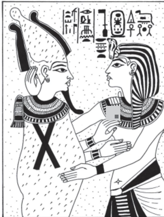
Mural in King Tut's tomb showing King Tut with Osiris, the god of the afterlife

Back in the trailer a technician pulled up astonishing images of Tut on a computer screen. A grey head took shape from a scattering of pixels, and the technician spun and tilted it in every direction. Neck vertebrae appeared as clearly as in an anatomy class. Other images revealed a hand, several views of the rib cage, and a transection of the skull. But for now the pressure was off. Sitting back in his chair, Zahi Hawass smiled, visibly relieved that nothing had gone seriously wrong. "I didn't sleep last night, not for a second," he said. "I was so worried. But now I think I will go and sleep."